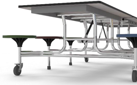
Steel Legs Available with chrome plated